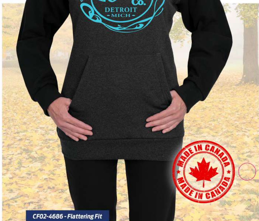
CF02-4686 - Flattering Fit

CF02-4686 | Charcoal Mix/Black/Teal Mix | S, M, XL, 2XL