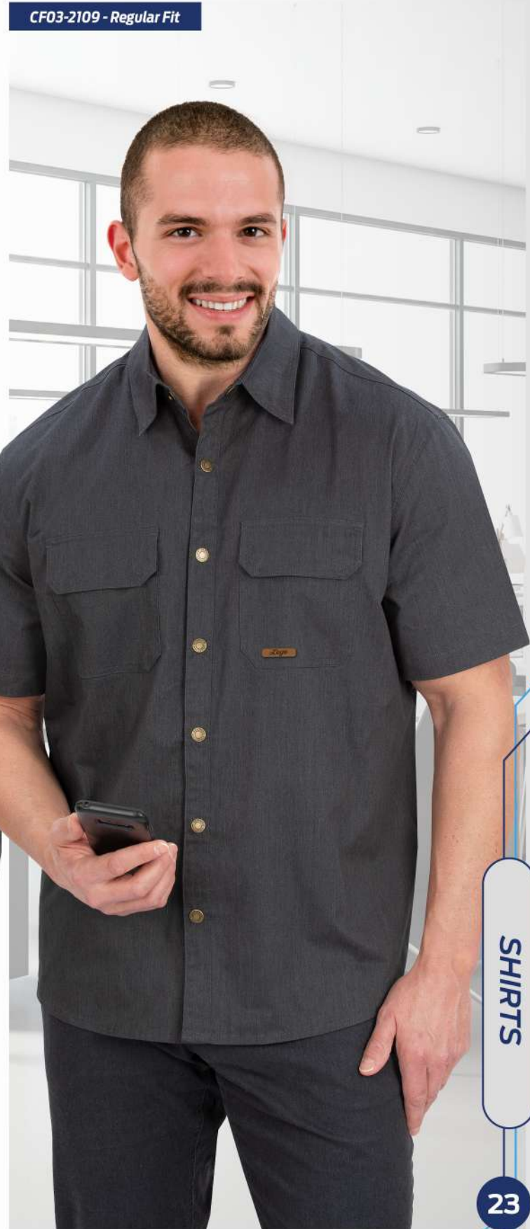
CF03-2109 - Regular Fit