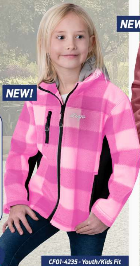
CF01-4235 - Youth/Kids Fit