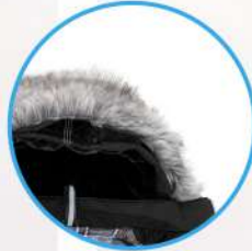
NEW SILVER FUR