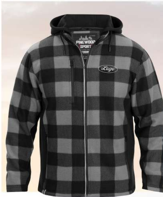
CF01-4139 - Regular Fit

XS (4-5), S (6-7), M (8-10) | Youth/Kids Fit