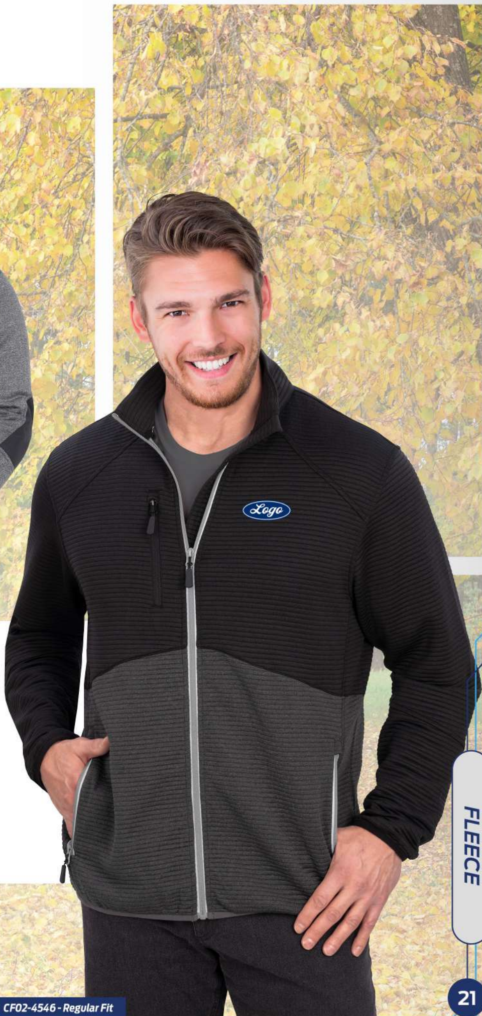
CF02-4546 - Regular Fit