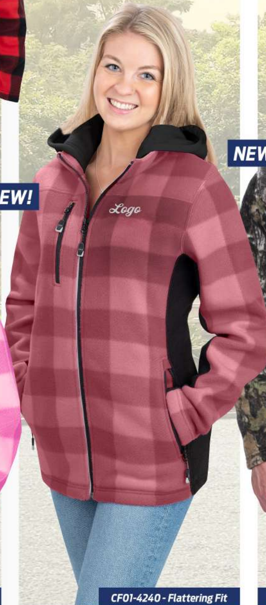
CF01-4240 - Flattering Fit