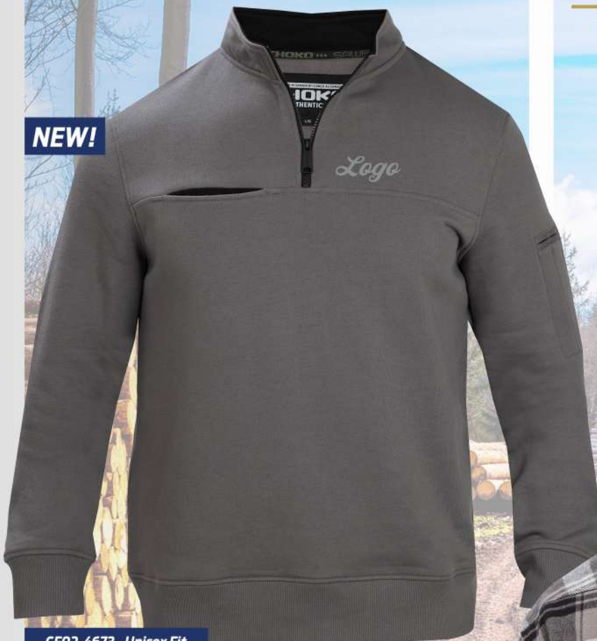
CF02-4673 - Unisex Fit