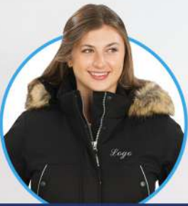
CF01-3930 - Flattering Fit