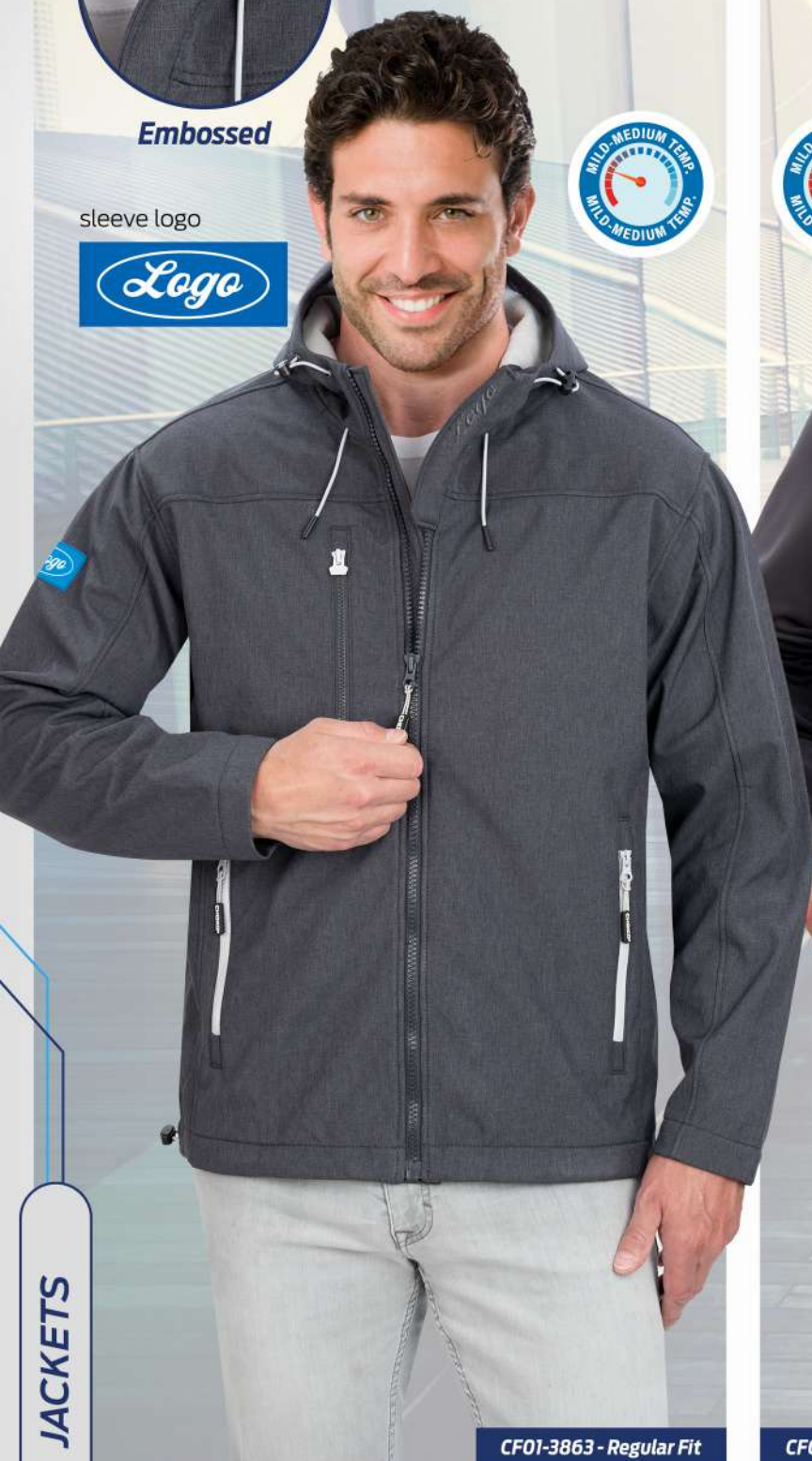
CF01-3863 - Regular Fit