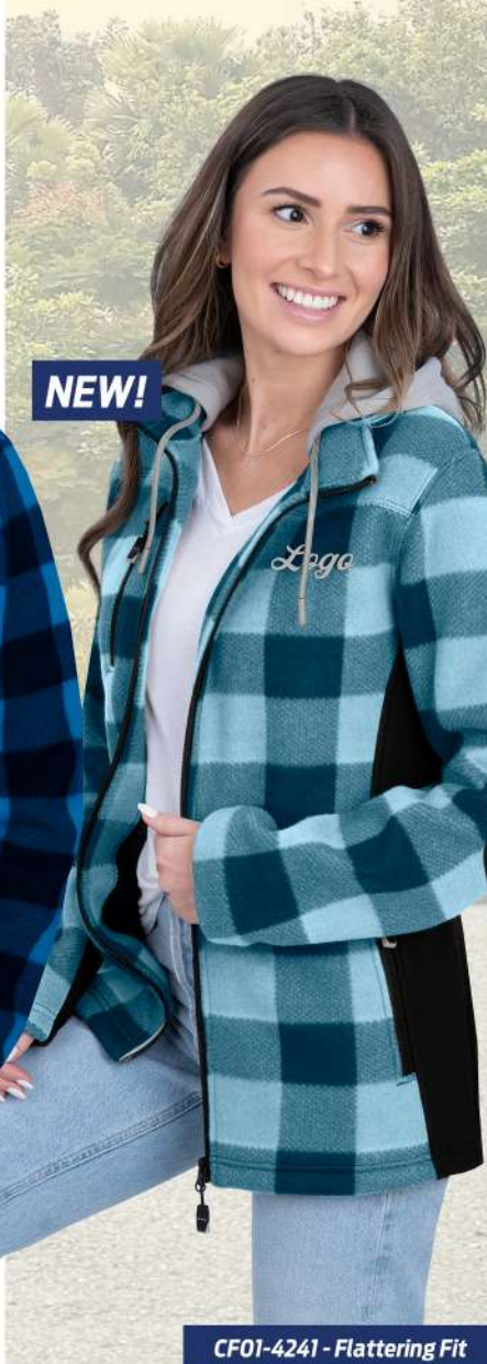
CF01-4241 - Flattering Fit