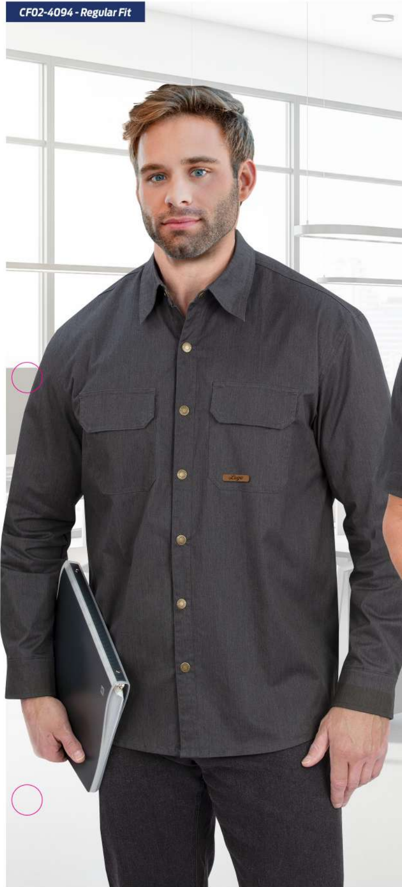
CF02-4094 - Regular Fit