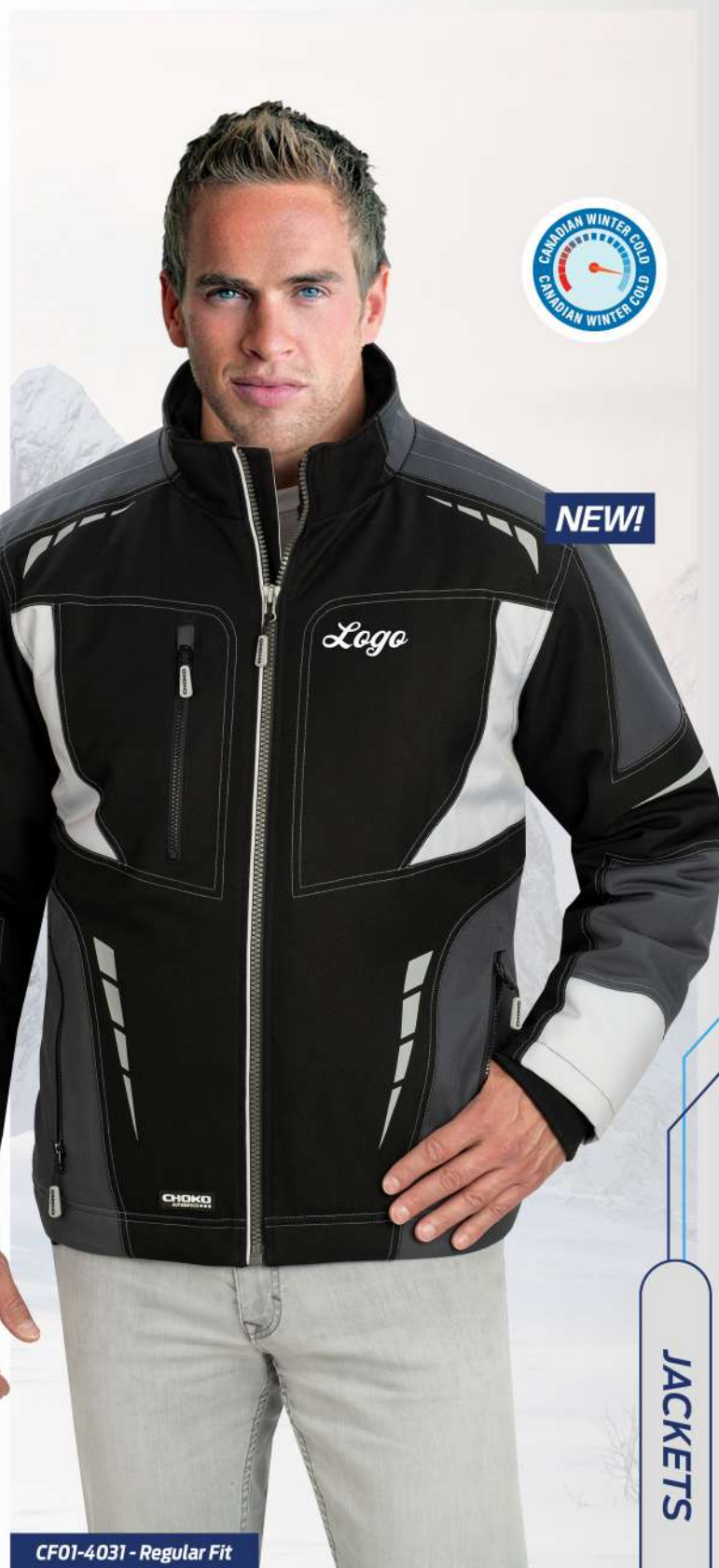
CF01-4031 - Regular Fit

CF01-4088 | Black/Black Melange/Turquoise | S-2XL | Ladies