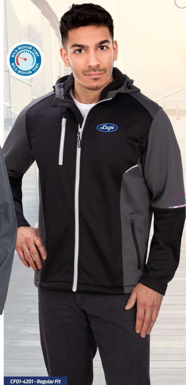
CF01-4201 - Regular Fit

CF01-3863 | Charcoal Mix/Silver | M-3XL | Men's