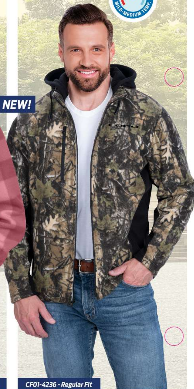
CF01-4236 - Regular Fit