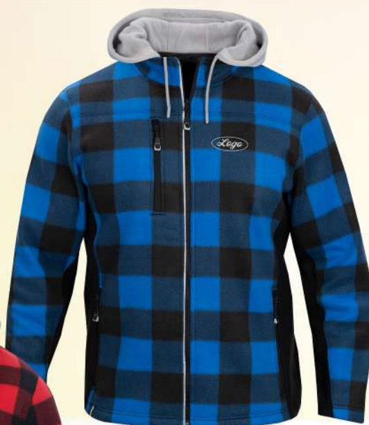
CF01-4188 - Regular Fit