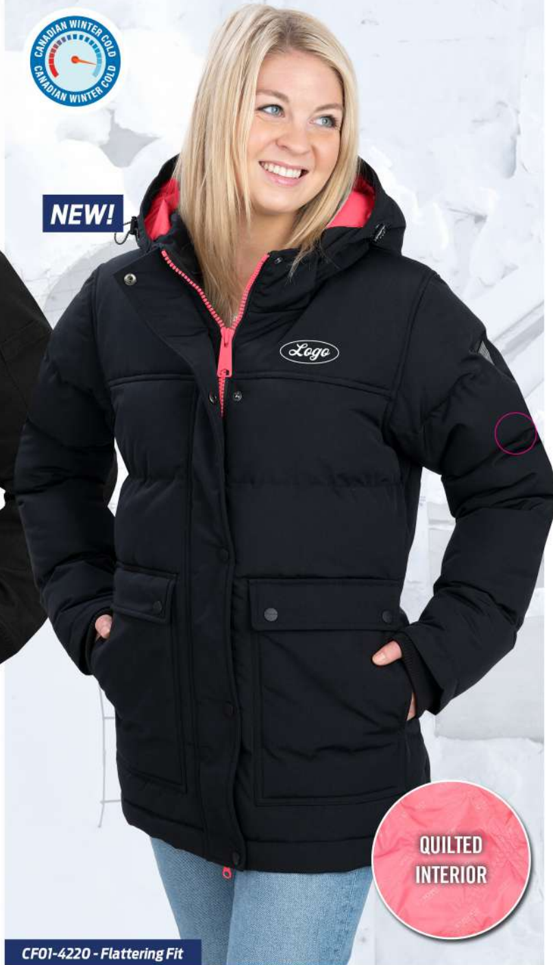
CF01-4220 - Flattering Fit