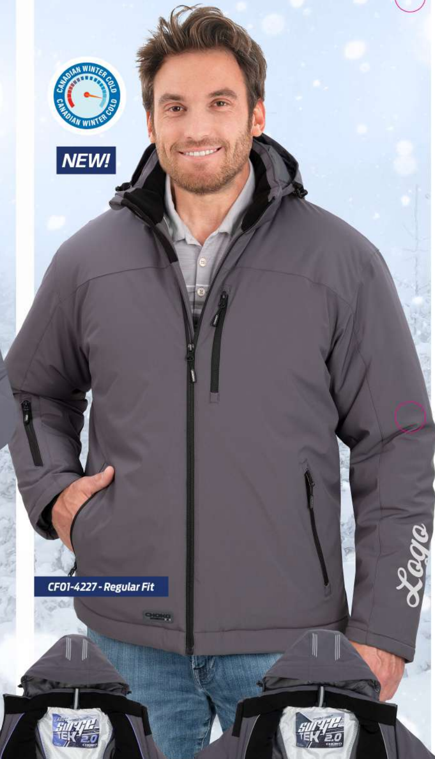
CF01-4227 - Regular Fit