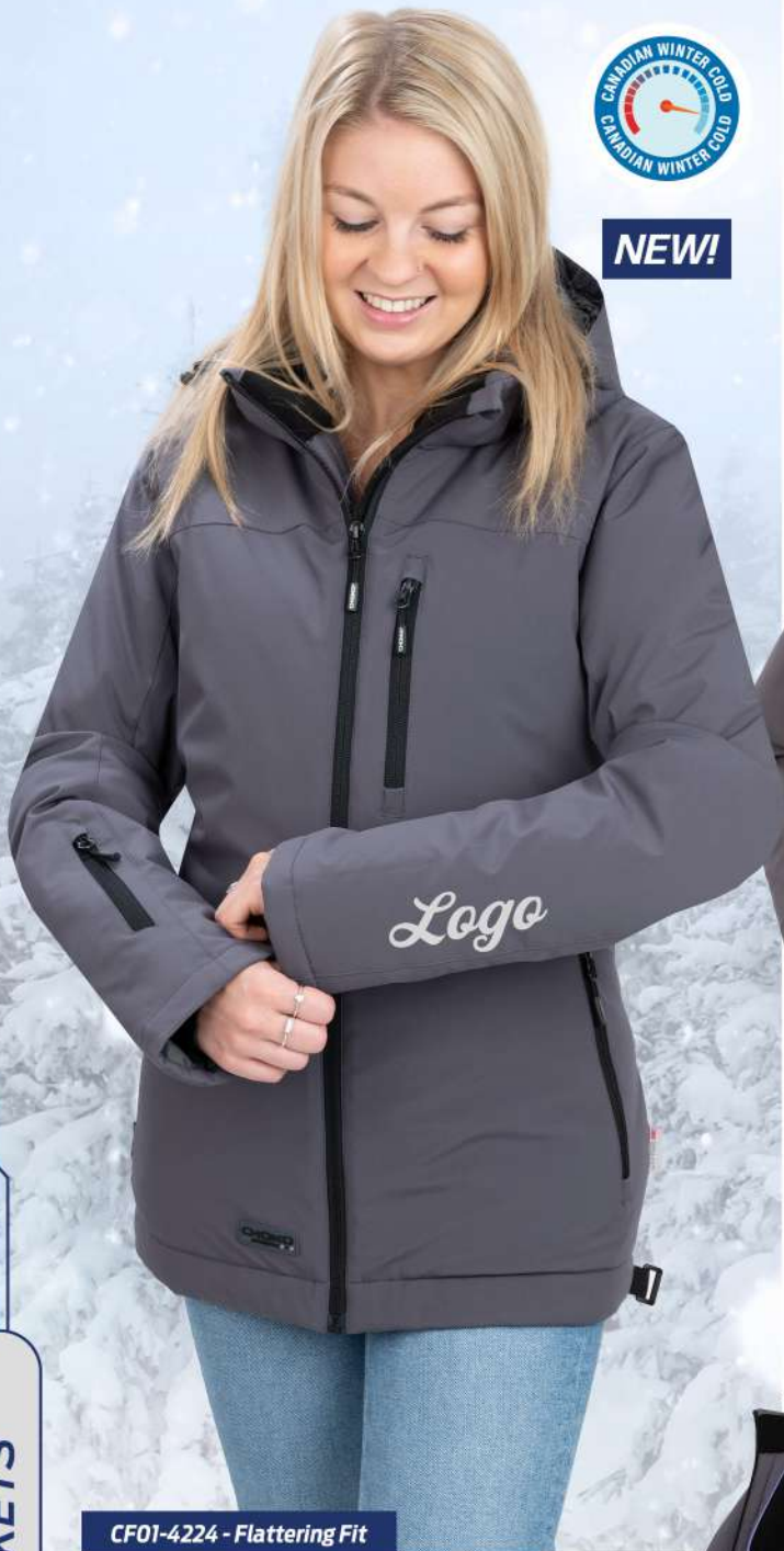
CF01-4224 - Flattering Fit