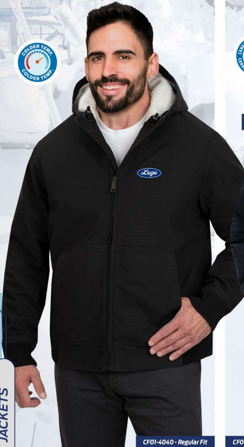
CF01-4040 - Regular Fit