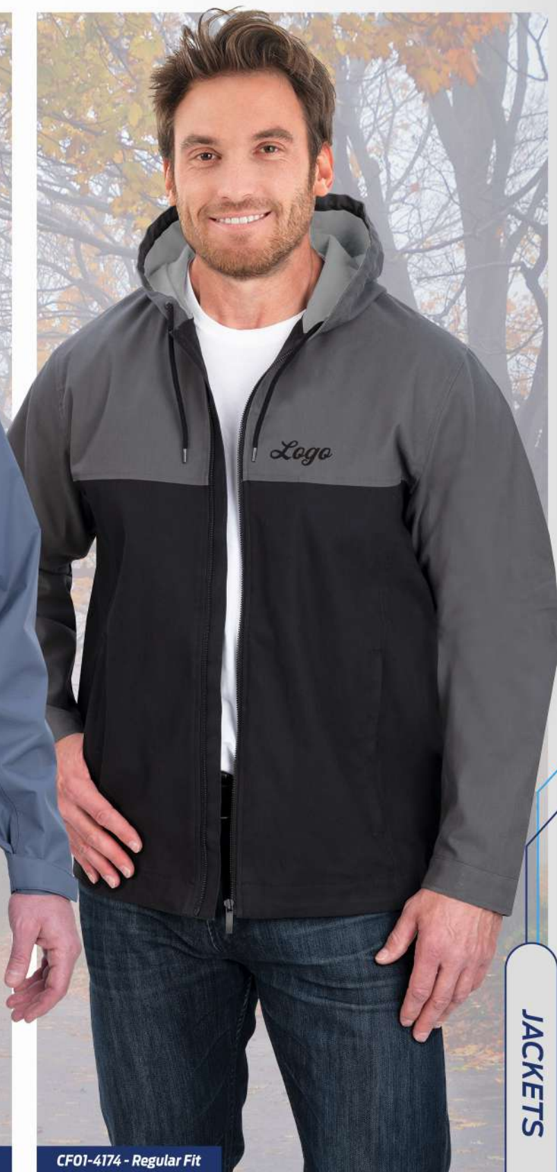
CF01-4174 - Regular Fit