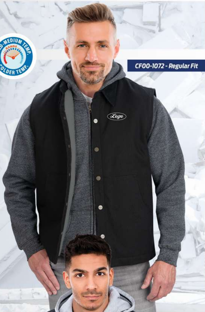
CF00-1072 - Regular Fit