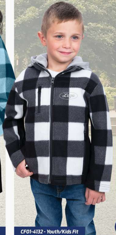
CF01-4132 - Youth/Kids Fit