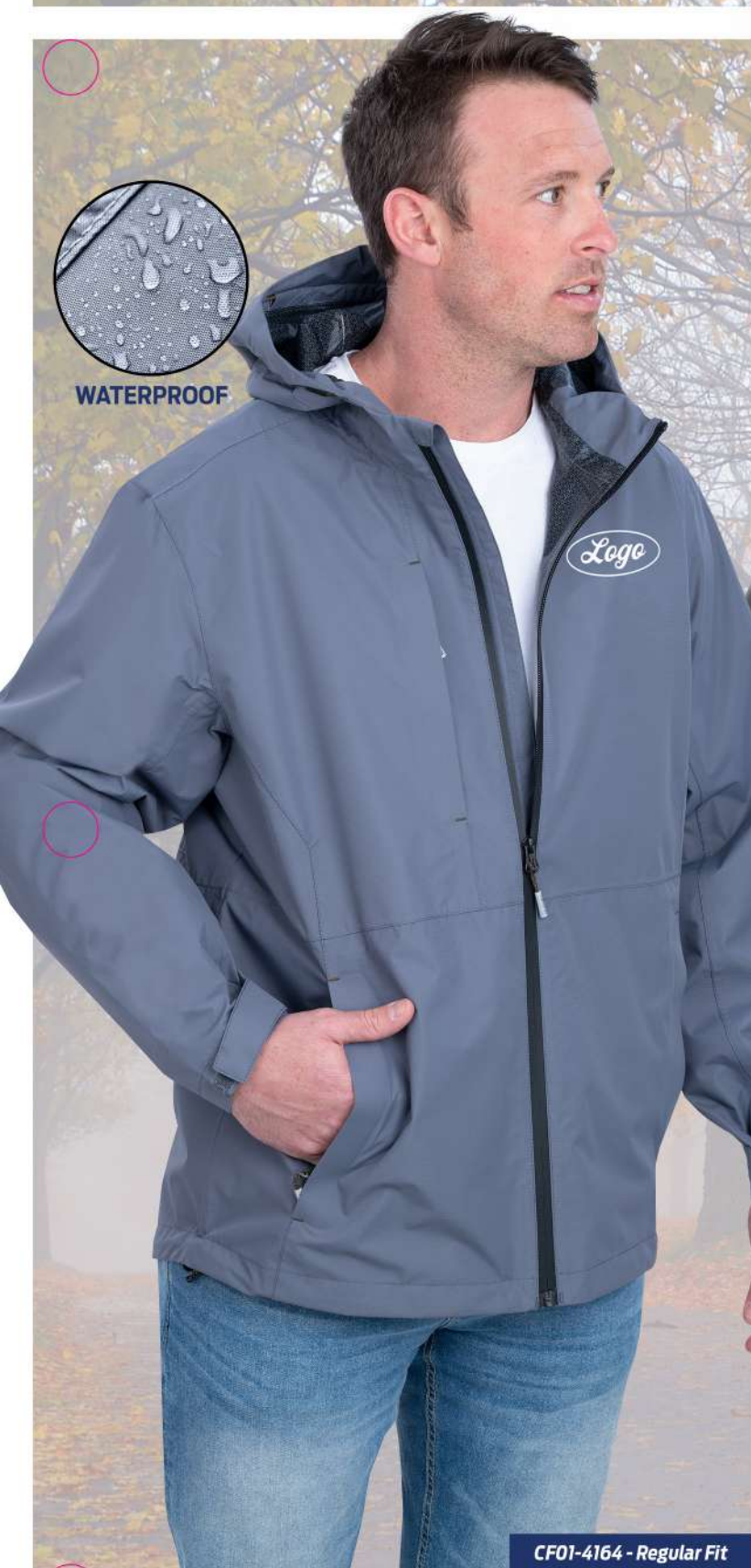
CF01-4164 - Regular Fit