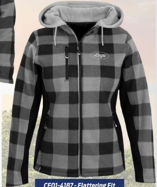
CF01-4187 - Flattering Fit