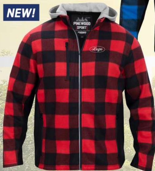
CF01-4127 - Regular Fit