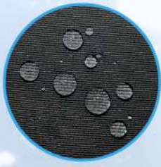
BREATHABLE & WATER RESISTANT