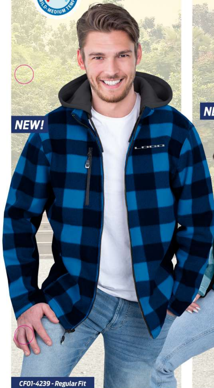
CF01-4239 - Regular Fit