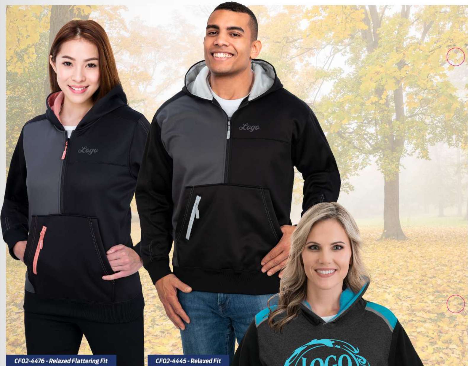
CF02-4476 - Relaxed Flattering Fit