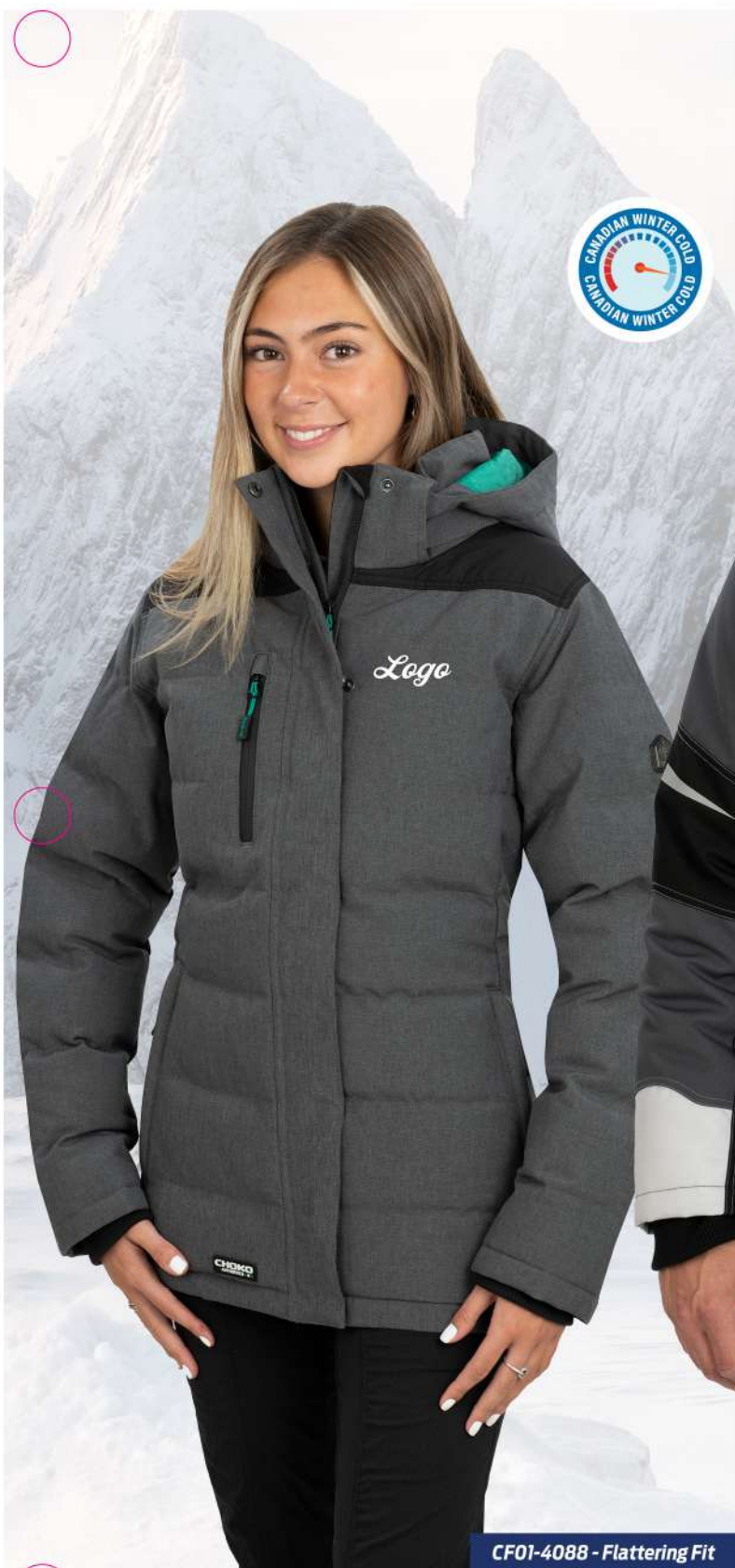
CF01-4088 - Flattering Fit