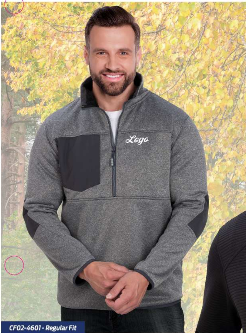
CF02-4601 - Regular Fit